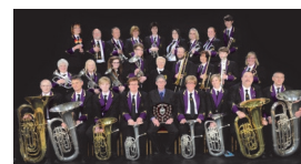
Swinton Brass Band