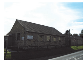
Swinton Reading Room And Community Hall

Obtain quote for a new fire door Obtain quote for a new fire door.