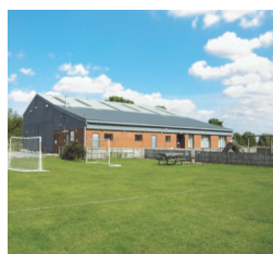
BSA Sports Centre

Hall and Lounge: £160.00 full day Hall only: £24.00 per hour Hall (one court): £8 per hour Lounge (with bar): £26.00 per hour Bingo: £26.00 per hour Children's Party: £37.00 one hour in hall plus half hour in lounge. Football (full season): £350.00 Football (one off match): £40.00