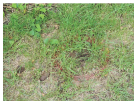
Red Circle of Shame.