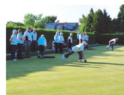
Flat Green Bowls